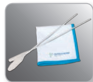
VueTip™ Trocar Swab Accessory Kit (sold separately; VUETIP10)